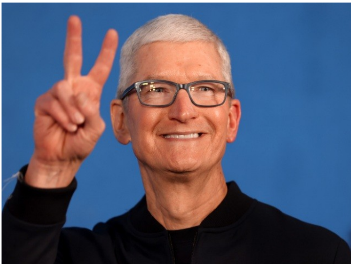
Tim "Apple" Cook Flashes V for Victory

The Verge reports that Apple CEO Tim Cook is not convinced by Facebook CEO Mark Zuckerberg's efforts to develop a digital "metaverse" where users will work, play, and socialize in an online 3D realm.